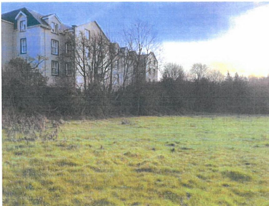
Photograph showing proximity of the Bunratty Hotel to the Lands